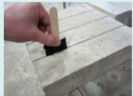
STEP TWO & THREE