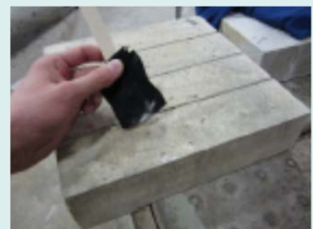
STEP FOUR & FIVE