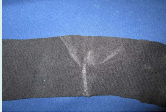
LIGHT — Additional Cleaning Recommended