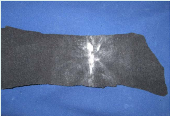
MODERATE — Additional Cleaning Required