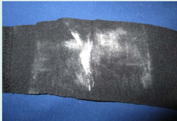
HEAVY — Reassess & Improve Cleaning Methods