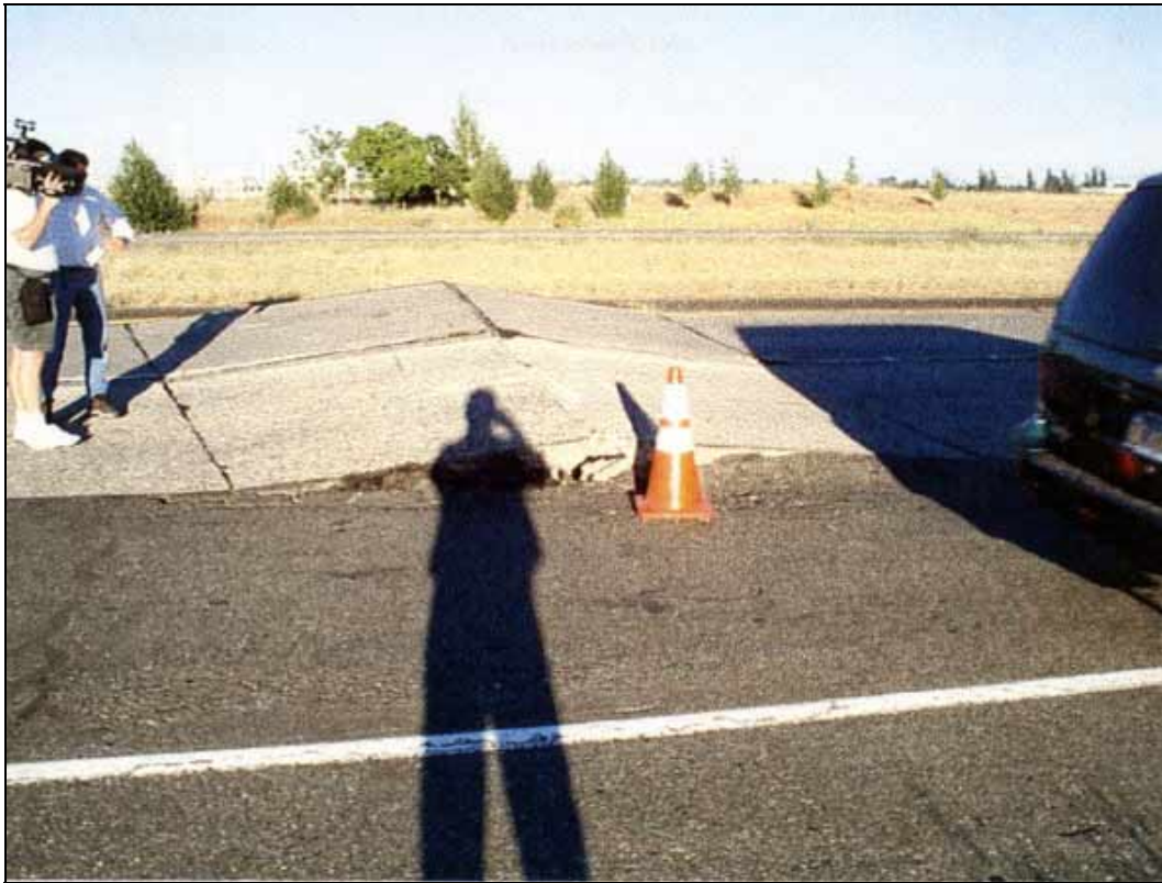
Figure 1. A 1998 blowup of a 24-year old unsealed Sacramento, California interstate pavement. Joint spacing, about 12 feet. This blowup was preceded by others in the same general vicinity several years earlier.

Although the first author prepared a Discussion of the paper that contained this challenge (2), a Discussion of a subsequent paper on the same subject (3), and an original paper on the pavement growth/pressure phenomenon and its destructive potential (4), it wasn't until an engineer colleague saw a blowup of an interstate pavement featured on a recent television news program in Sacramento, California (Figure 1) that the form of this response to WisDOT's challenge began to emerge and take shape. Subsequently, after a thorough literature search, an extensive internet exploration, and voluminous correspondence with pavement engineers both in the United States and abroad, the following discussion and documentation of the long-term unsealed pavement experience was developed.